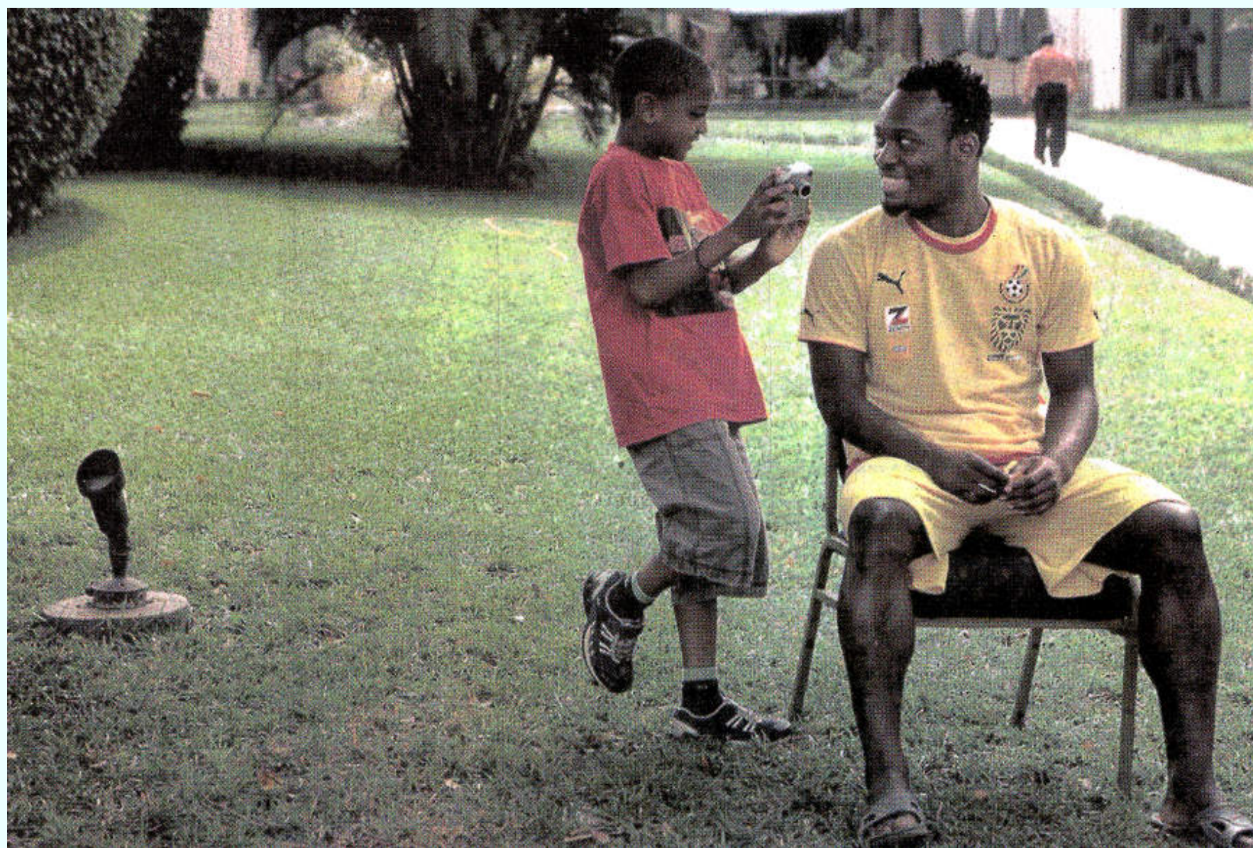
Ghana midfielder Micheal Essien is pictured with a fan at the Feista Royale Hotel, Accra, in the book A game of Passion, Soccer in Africa .